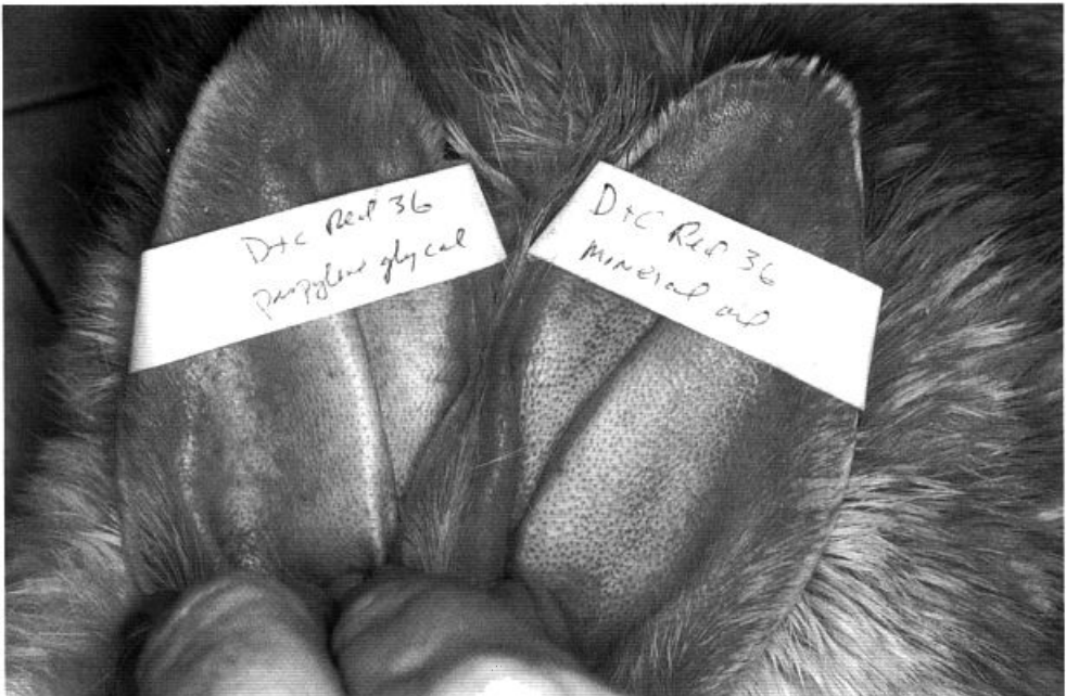
Figure 5. The comedogenicity of D&C red #36 when incorporated into two different vehicles. The vehicle may increase or decrease an ingredient's ability to produce follicular hyperkeratosis.

These studies indicate that skin care preparations that are nonirritating and noncomedogenic can be made. Nonreactive ingredients can be used to make elegant products, and borderline ingredients can be combined with other ingredients to reduce the reactions to acceptable levels. In spite of these guidelines, new formulations must always be examined with the rabbit ear assay before the cosmetic chemist can be assured that his ideas work.